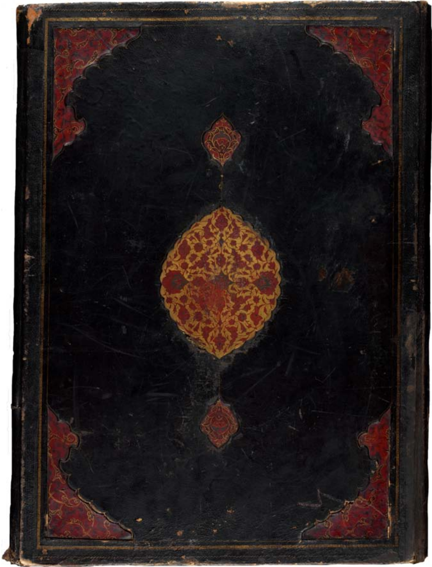
FIGURE 1 University of Leipzig, MS B. or. 1, front board: The fragment in Leipzig is outfitted with an Ottoman binding