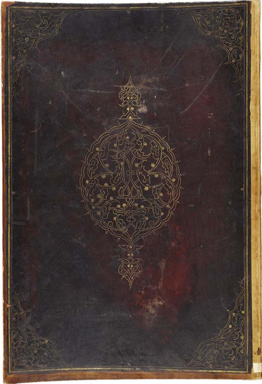
FIGURE 3 Sächsische Landes- und Universitätsbibliothek Dresden, MS Eb. 444, front board: The Dresden binding is of a different design and smaller proportions than the Leipzig one