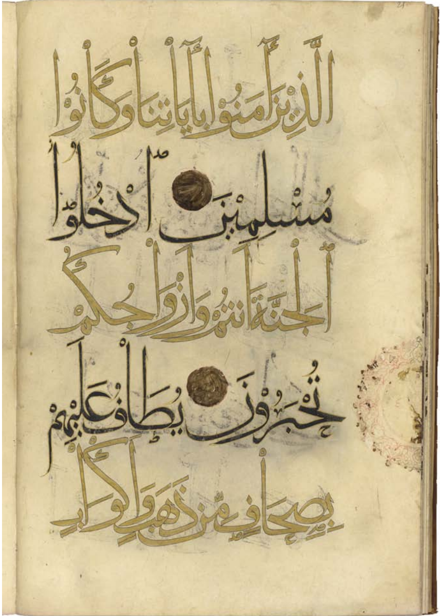
FIGURE 6 Sächsische Landes- und Universitätsbibliothek Dresden, MS Eb. 444, fol. 27 v : Most ornaments in the Dresden volume have not been finished and those in the margins were cut away