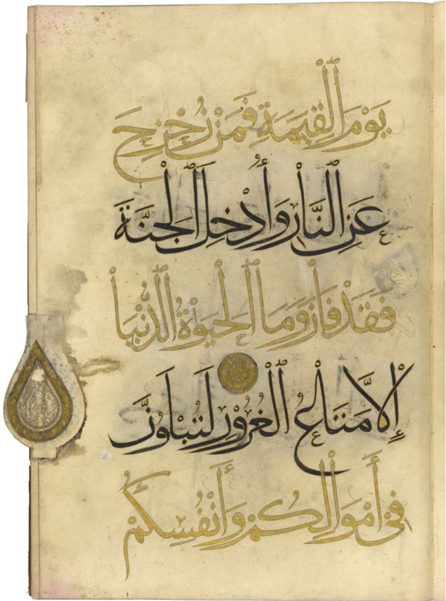
FIGURE 4 Sächsische Landes- und Universitätsbibliothek Dresden, MS Eb. 444, fol. 7r: Some marginal ornaments in Dresden have been fully executed, then cut out and folded into the textblock to preserve them