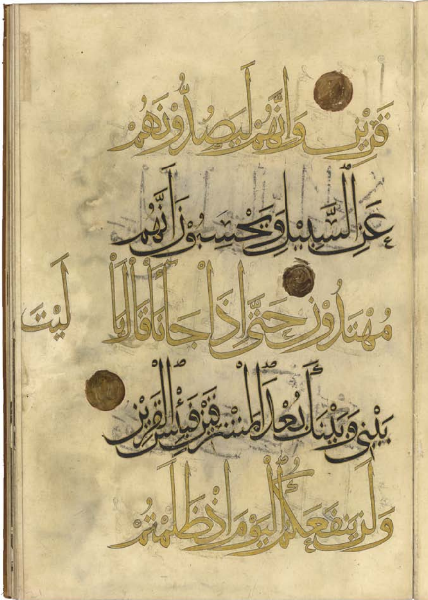
FIGURE 5 Sächsische Landes- und Universitätsbibliothek Dresden, MS Eb. 444, fol. 21r: Due probably to the different lines of gold and black script being executed separately, the writing was occasionally condensed and even spilled over into the margins