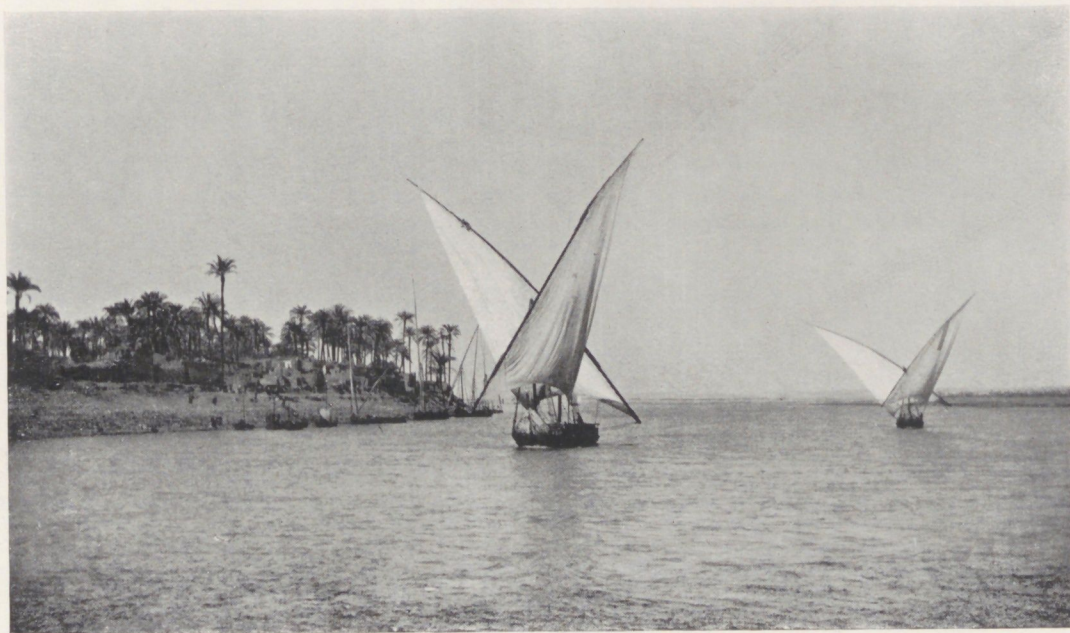
NATIVE GYASSAS IN A BREEZE.