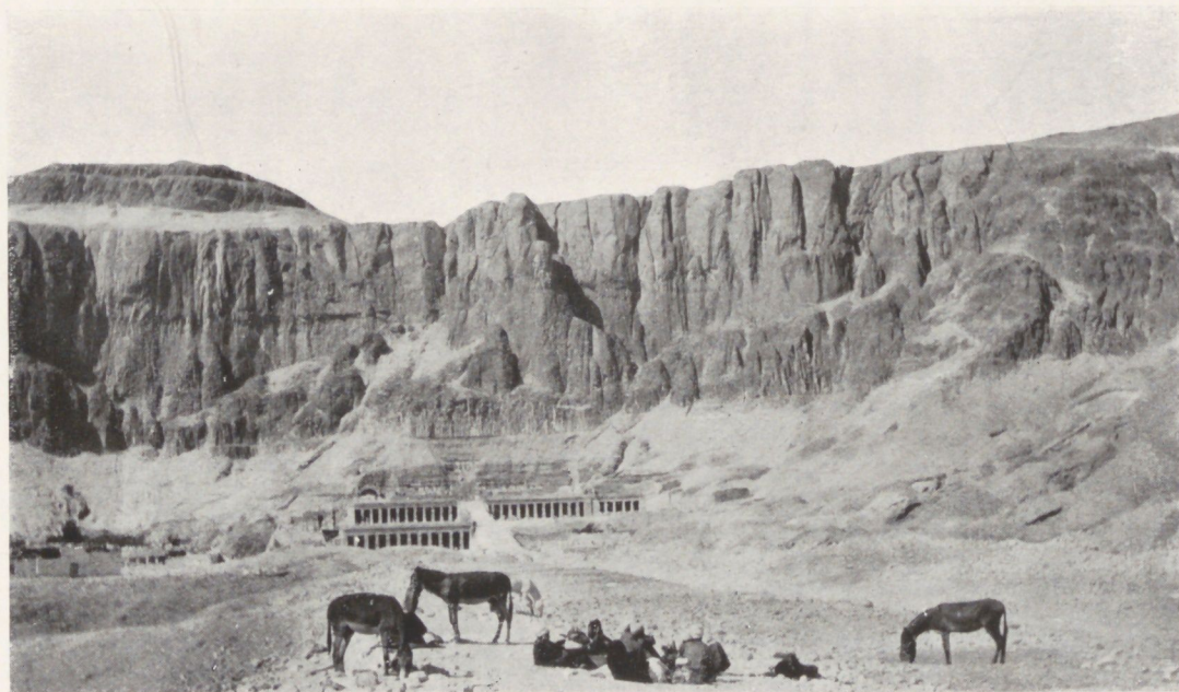
A HALT OPPOSITE THE TEMPLE OF HATASOO.