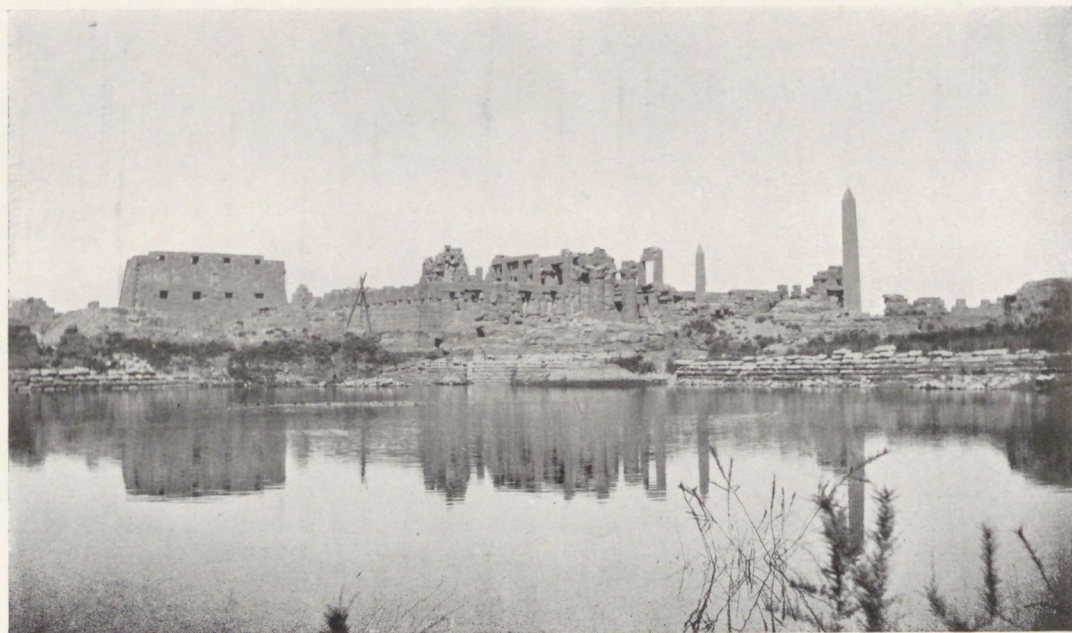
THE TEMPLE OF KARNAC FROM THE SACRED LAKE.