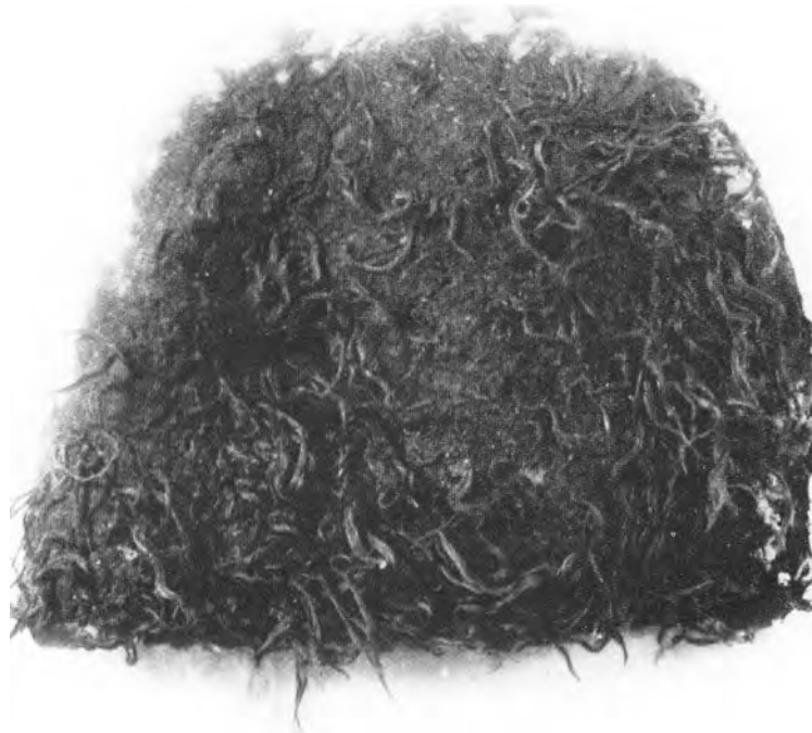
Fig. 12. Zamṭ