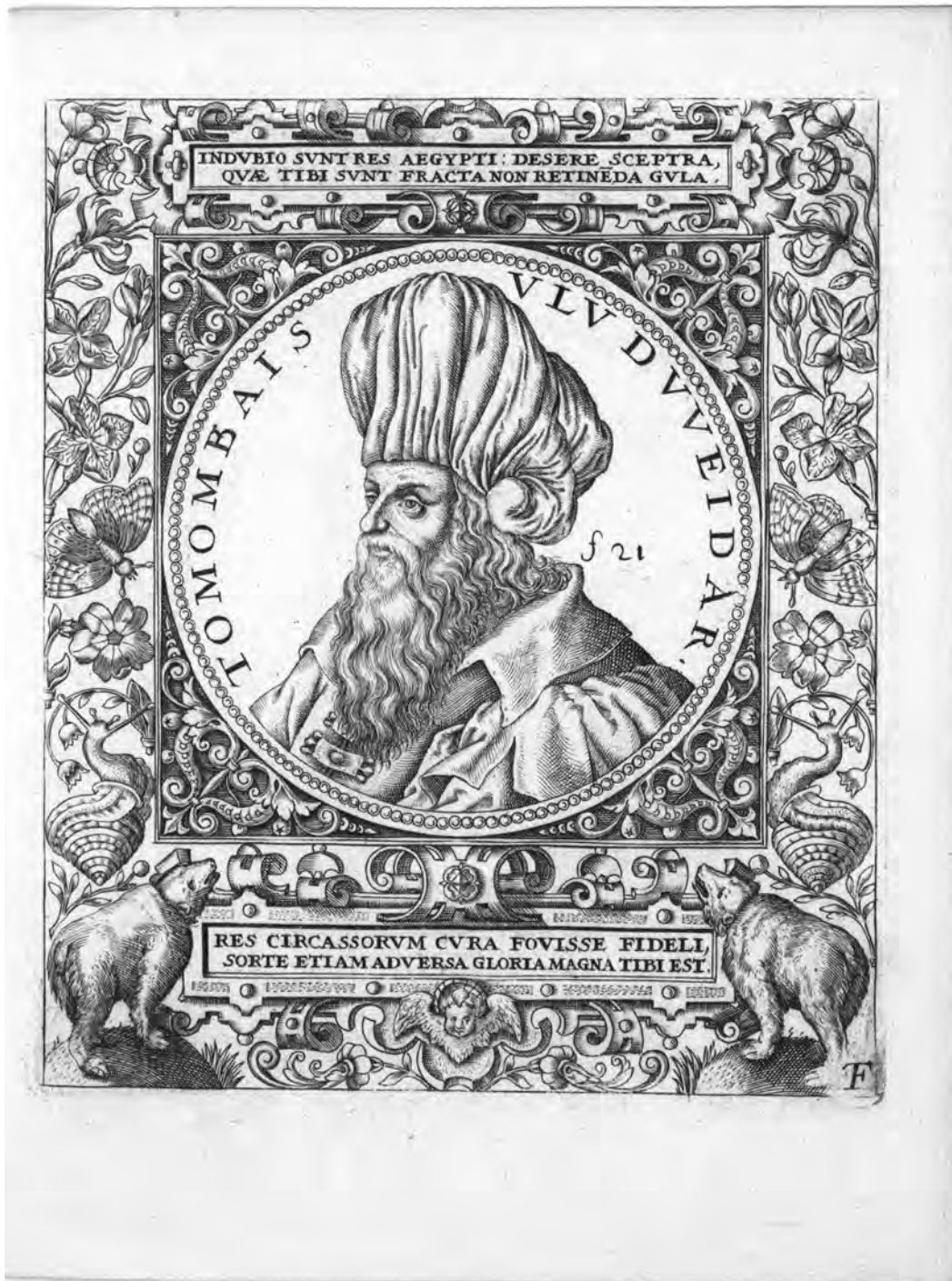
Fig. 10. Tūmān Bāy