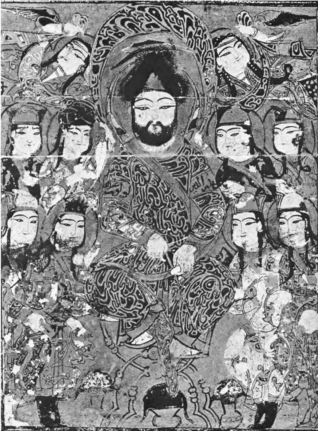
Fig. 3. Ruler wearing a qabā' turkī with ṭirāz bands

Article: http://mamluk.uchicago.edu/MSR_XII-2_2008-Fuess-pp71-94.pdf