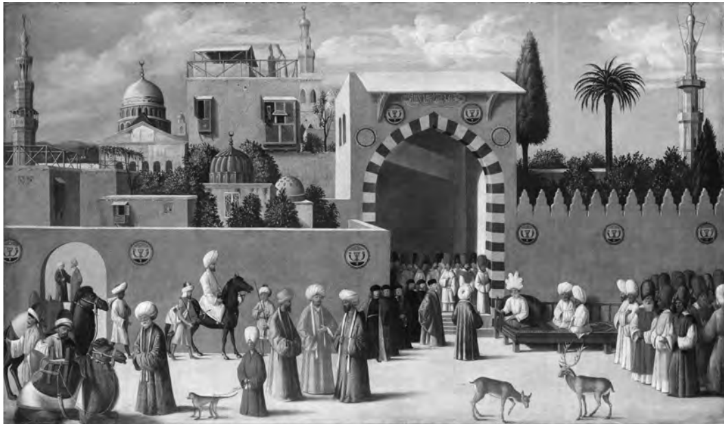
Fig. 8. Reception of the Ambassadors