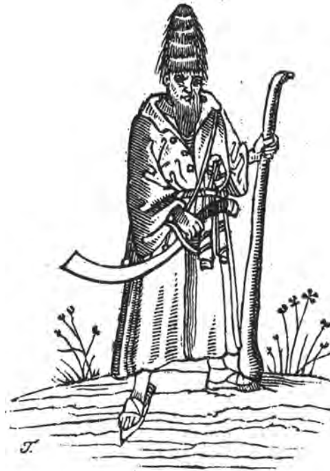
Fig. 11. Red zamṭ