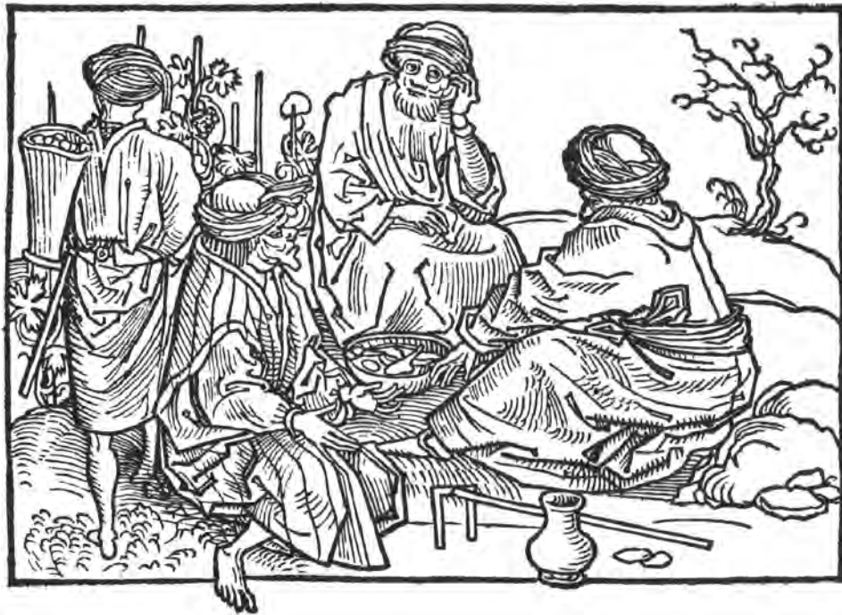
Fig. 1. Syrian Christians