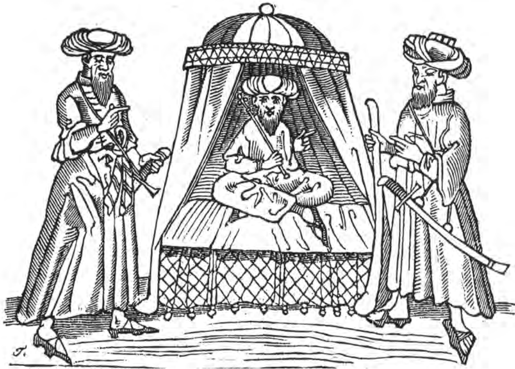
Fig. 7. Sultan al-Nāṣir Muḥammad on his throne