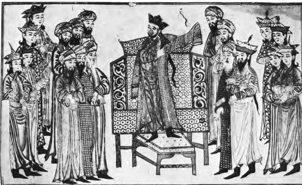
Fig. 2. Maḥmūd of Ghaznah donning a khil'ah