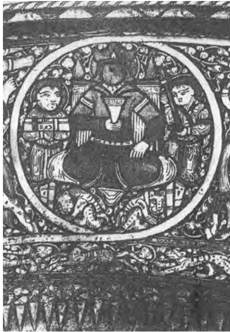
Fig. 4. Inner medallion of the Baptistère de Saint Louis