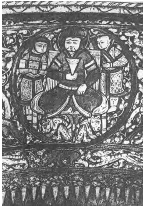
Fig. 5. Inner medallion of the Baptistère de Saint Louis