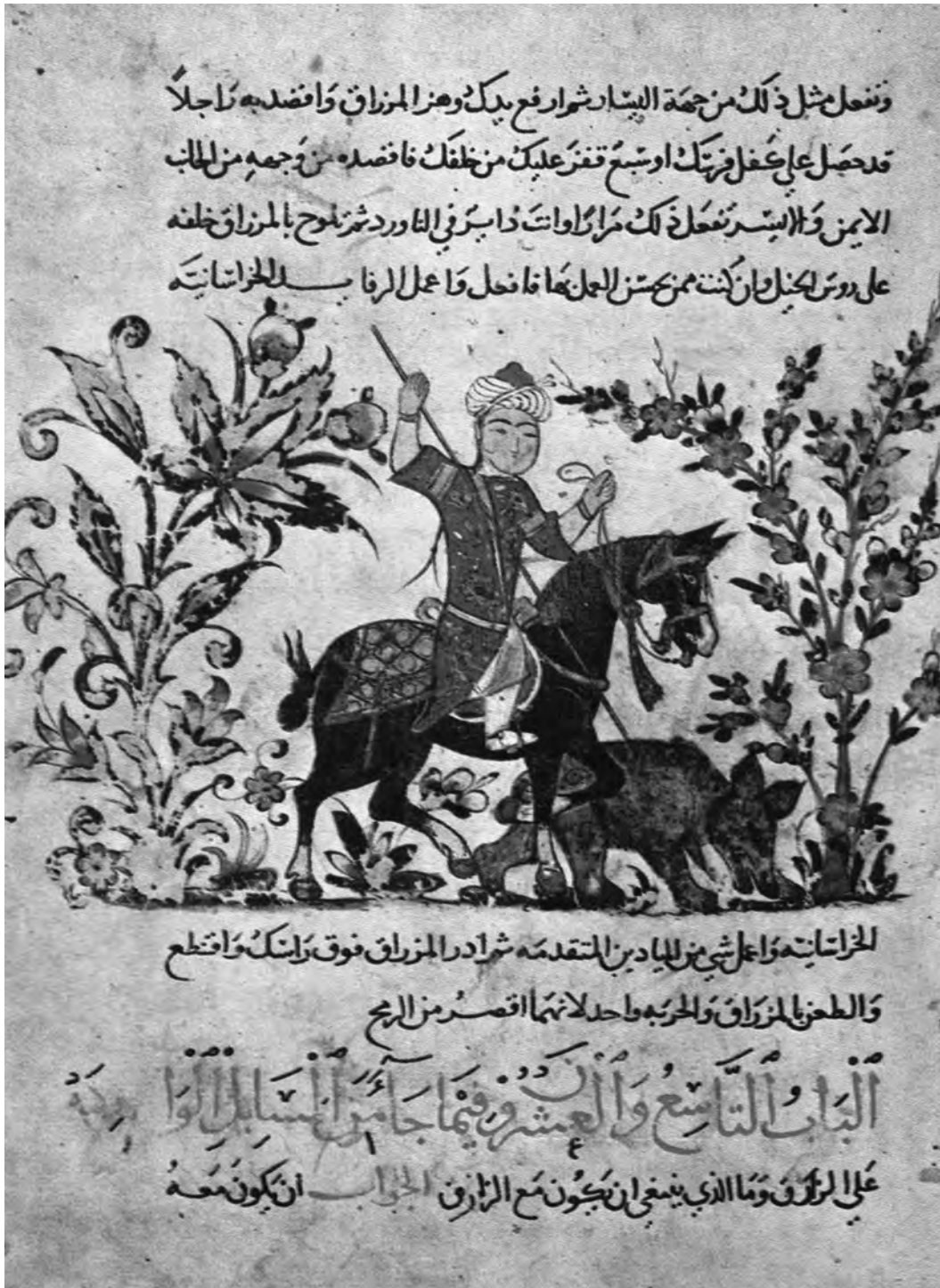
Fig. 6. Mamluk wearing the kallawtah