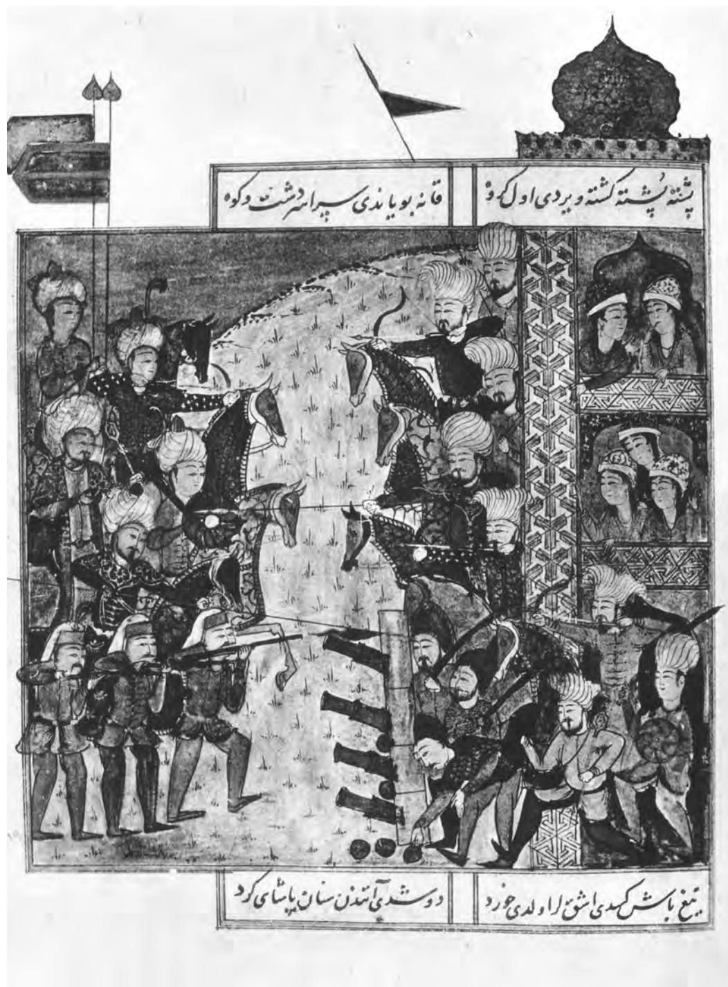
Fig. 13. Ottomans besieging the Mamluks in Damascus

Article: http://mamluk.uchicago.edu/MSR_XII-2_2008-Fuess-pp71-94.pdf