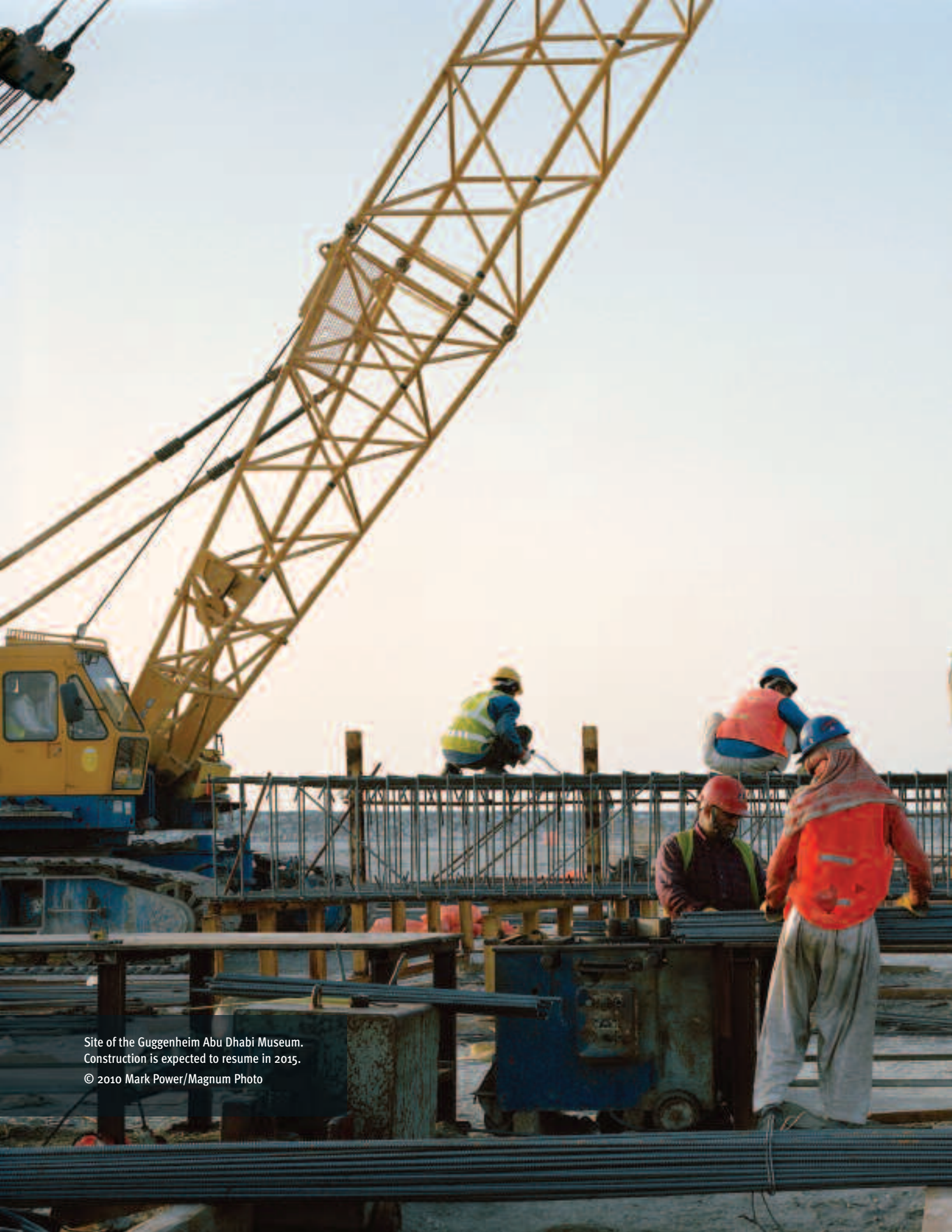
Site of the Guggenheim Abu Dhabi Museum. Construction is expected to resume in 2015.