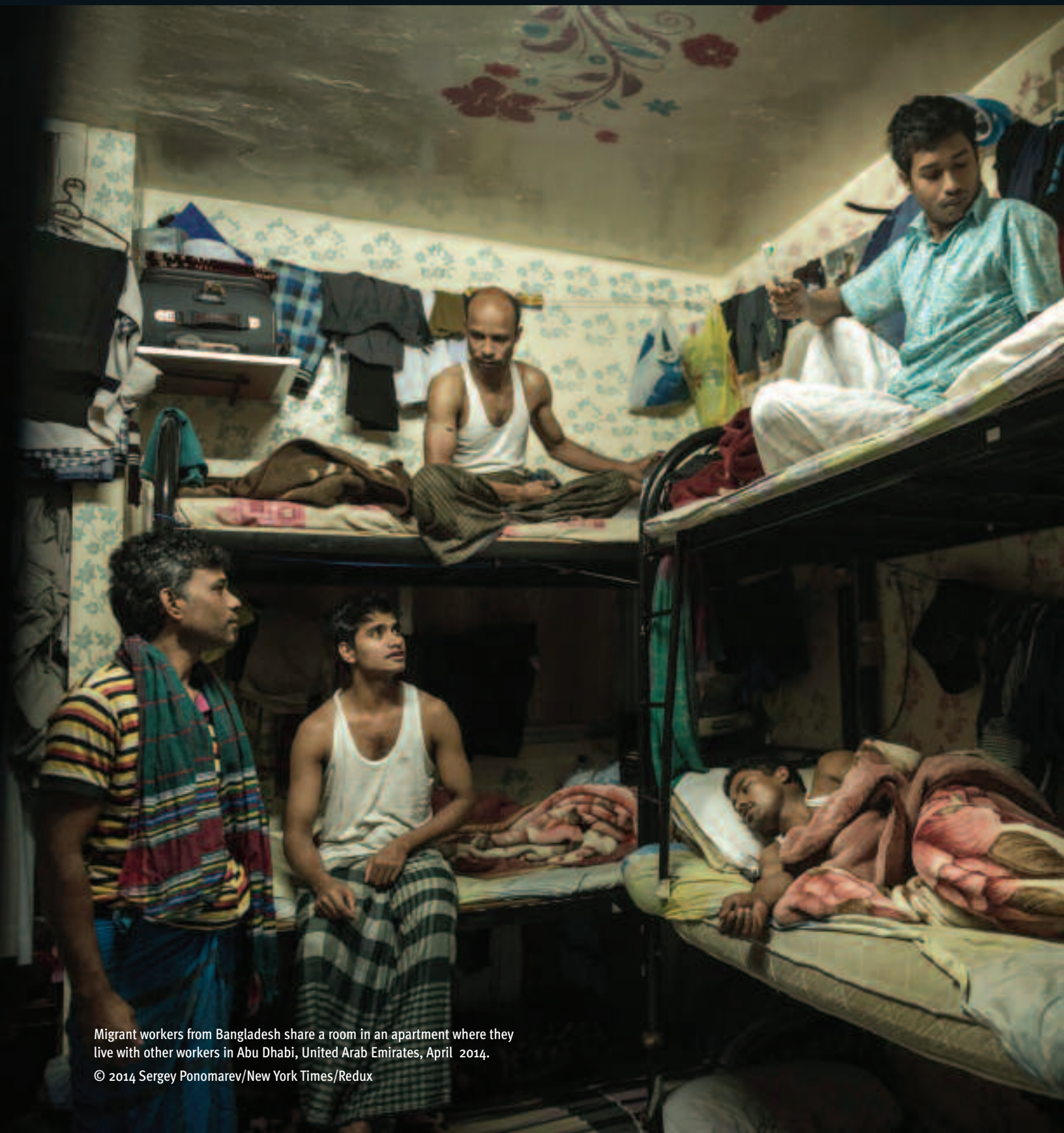
Migrant workers from Bangladesh share a room in an apartment where they live with other workers in Abu Dhabi, United Arab Emirates, April 2014.