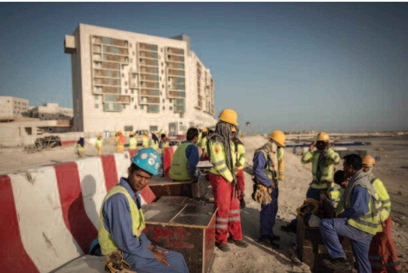
Migrant workers from Bangladesh share a room in an apartment where they live with other workers in Abu Dhabi, United Arab Emirates, April 2014.