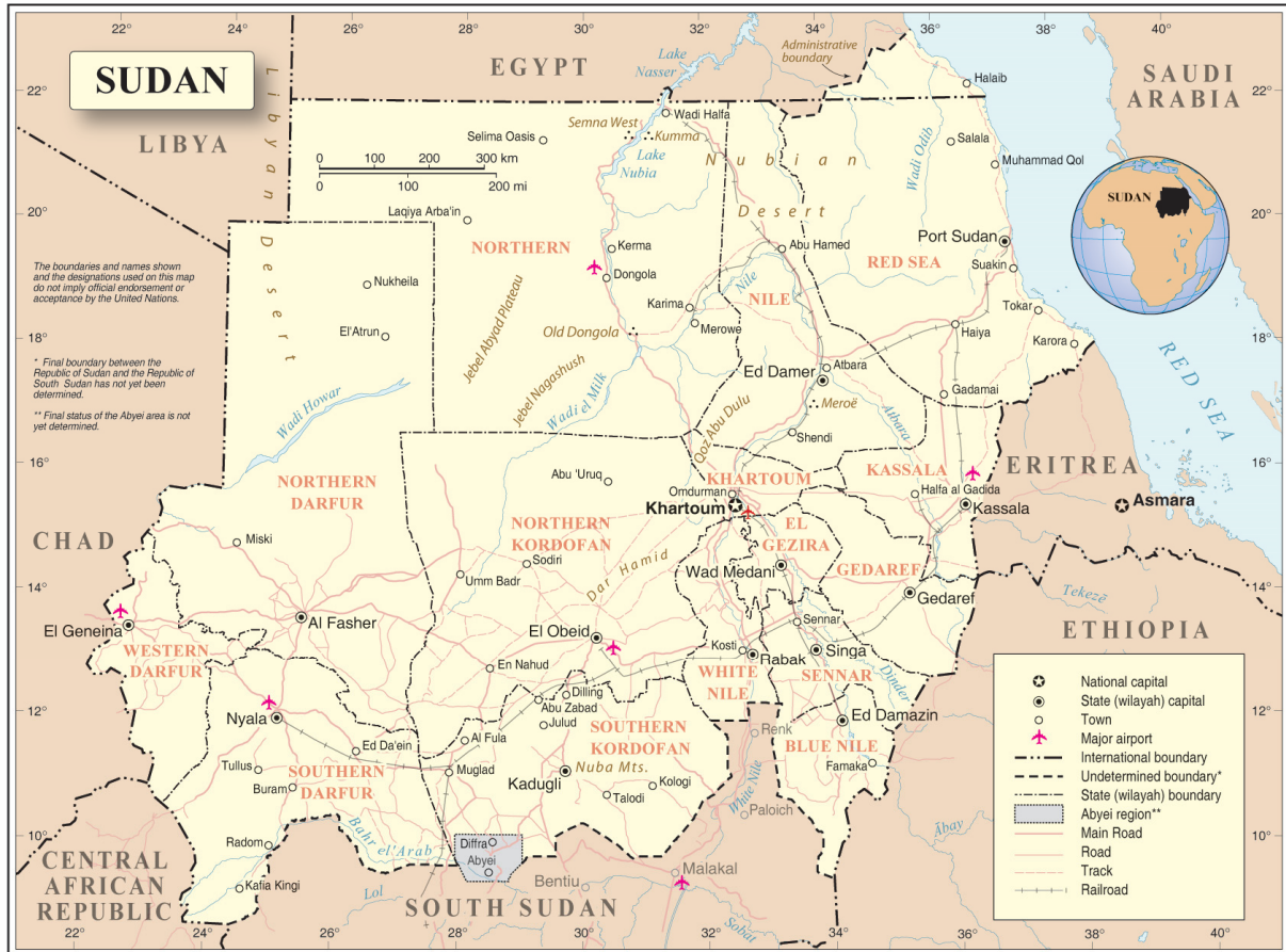
This map does not represent the recent sub-division of the existing Darfur states (adding Central and East Darfur) and Kordofan (adding West Kordofan).