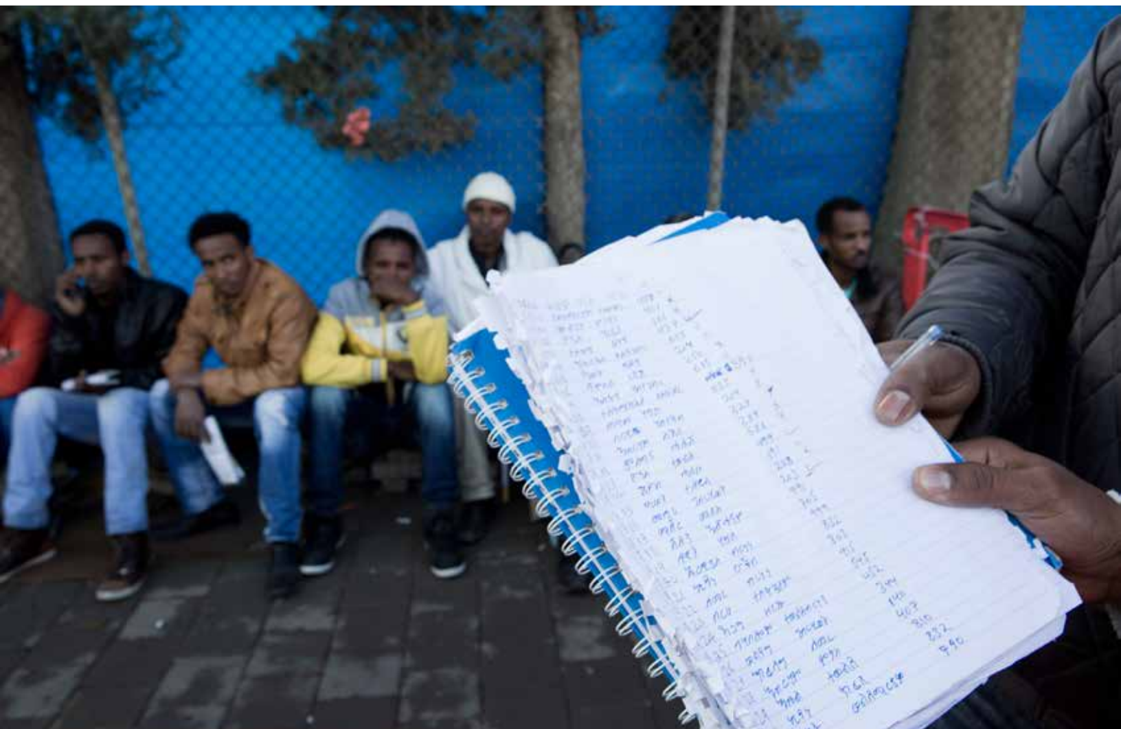
Sub-Saharan African nationals wait outside Israeli Interior Ministry offices in Tel Aviv on March 13, 2014 to renew their “conditional release permits.” Any Eritrean or Sudanese who entered Israel before May 31, 2011 can have their permit cancelled and be summoned to report to the Holot “Residency Center” in Israel’s Negev desert where they face indefinite detention.

Fairly reviewing tens of thousands of individual asylum claims in line with international refugee law standards would run up huge bills, take years, and, in any case, lead to the likely conclusion that all Sudanese and most Eritreans in Israel have valid refugee claims.