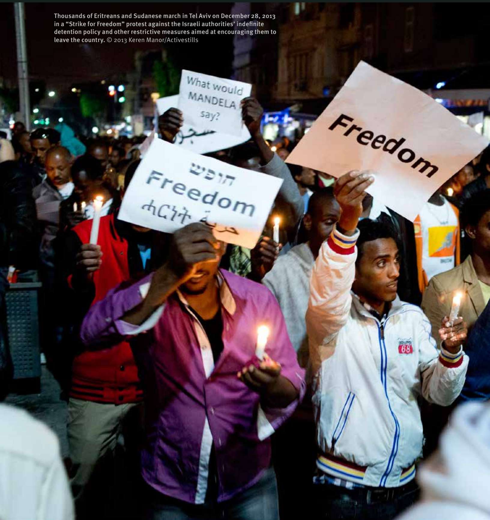
Thousands of Eritreans and Sudanese march in Tel Aviv on December 28, 2013 in a "Strike for Freedom" protest against the Israeli authorities' indefinite detention policy and other restrictive measures aimed at encouraging them to leave the country.